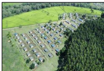
Photo 2: Aerial view of employees housing units in our estates in Nandi Hills

However, the people depending on our business for their livelihood are much more than listed above.