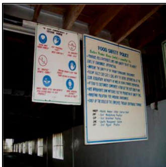
Photo 10: Safety signage within the factories promotes awareness and enhances food handling practices.

product safety and also participate in voluntary initiatives.