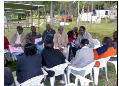
Photo 7: One of the many consultative meetings held by Management for planning purposes, grievance hearing, and monitoring and evaluation purposes

All human rights aspects are monitored on a daily basis and reported by the businesses on a Monthly basis. The Technical departments and Internal audit departments carry out impromptu visits, checks and audits and raise any issues of concern with the concerned and reports to the Top management.