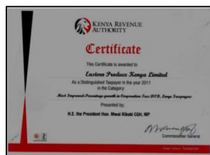
Photo 8: Copy of the certificate awarded to the Company as a distinguished tax payer in Kenya in 2011

Our Core value: - To act honestly, fairly and with integrity and respect in all business dealings. Acting lawfully and honestly is fundamental to our business philosophy. The management of each unit is responsible for compliance with the company codes, thereby ensuring that social and environmental issues are integrated into daily business. The codes are in form of confidential standing instructions referred to as Company Blue, Red, Green, Yellow, white and black books.