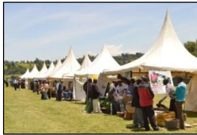
Photo 6: farmers and neighboring communities during one of the Field days

In all our businesses, employees were trained on various aspects of Human rights and their rights as employees. This included communication on their right to join a recognized workers union, right to a safe work environment and right to be considered for employment without discrimination. EPK enhanced this communication by erecting notice boards at strategic points for communicating policies related to social, environmental and safety issues. Trainings and capacity building for employees on human rights issues were conducted and refresher trainings will be conducted in the coming year. Security personnel were trained on conducting body searches to enhance humane treatment of colleagues.