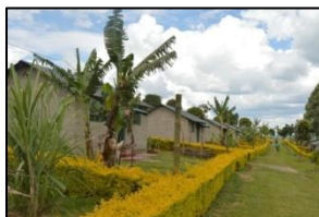
Photo1: Employee housing units in one of our estates

Responsibility (CSR) Department that is run by a committee of top management, who have the responsibility of ensuring that the CSR policy is implemented across the group in a manner appropriate to all sectors in which our businesses operate.