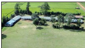
Photo3: One of the 15 primary schools constructed by the company for employees and surrounding communities' children of school going age

While we focused on the commercial need to procure goods and services of the required specification and quality on the most favorable terms, we work collaboratively with our suppliers to ensure that availability is sustainable in the long term and that contracts are fair and business relationships are mutually beneficial.