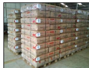
Photo 9: Hygienically packed teas with correct labeling and all relevant information indicated.

Product safety is paramount in all operations from farm, transportation, processing, packaging and freighting to customers destinations. The Operations Director has the overall responsibility for ensuring that the objectives on food safety are met. This responsibility has been communicated to the management in charge of the units. All our tea factories have attained FSSC certification and currently in the preparation phase for FSSC 22000 surveillance audits