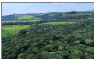
Photo 4: Aerial view of the tea field intertwined with forestry cover in a bid to enhance biodiversity.

Apart from the indigenous forests there are no other natural resources of significance in the area. No mineral resources have been found on any of the estates. Due to our environmental requirements certification by Rainforest Alliance was obtained in 2007 for the first time and recertified to date to ensure sustainable agricultural practice and sound environmental practices. To prevent any chemical degradation due to the use of pesticide the necessary precautions are taken as per the Premier foods pesticide audit.