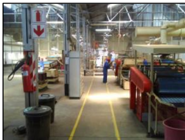
Photo 5: Inside one of the factories. Note the housekeeping, marked walkways, guarded machinery and fire extinguishers provision.

We provide the necessary equipment to protect workers and guarantee that the tools, infrastructure, machinery and all equipment used on the farms is in good condition and does not pose a danger to human health or the environment.